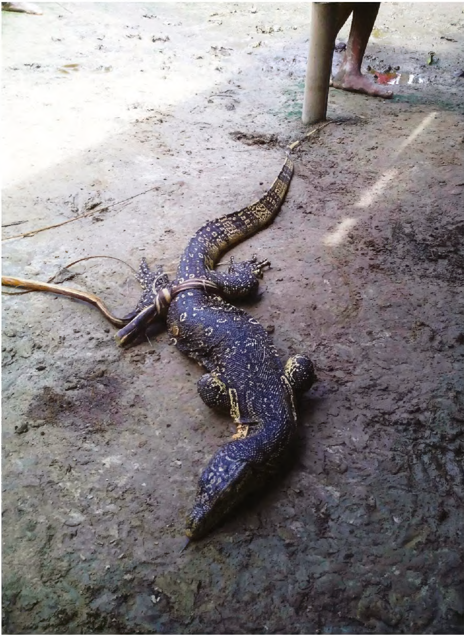
Fig. 3. A Common Water Monitor ( Varanus salvator ) killed for venturing into a human habitation at Rongpur 6, Hailakandi. It was subsequently buried.

from the base of the tail of the lizard, called Shandar tel ('Oil of the Monitor lizard' in the local language), is used as a sexual lubricant by man. Although the Bengali community people, who are the majority in the present study area, do not consume the lizard themselves, they catch any individuals that venture into the settlements and sell them to the tribes. A moderate sized individual may cost up to 1,000–1,500 INR (~14–21 USD), while the oil is sold at the rate of 500 INR/L (~7 USD).